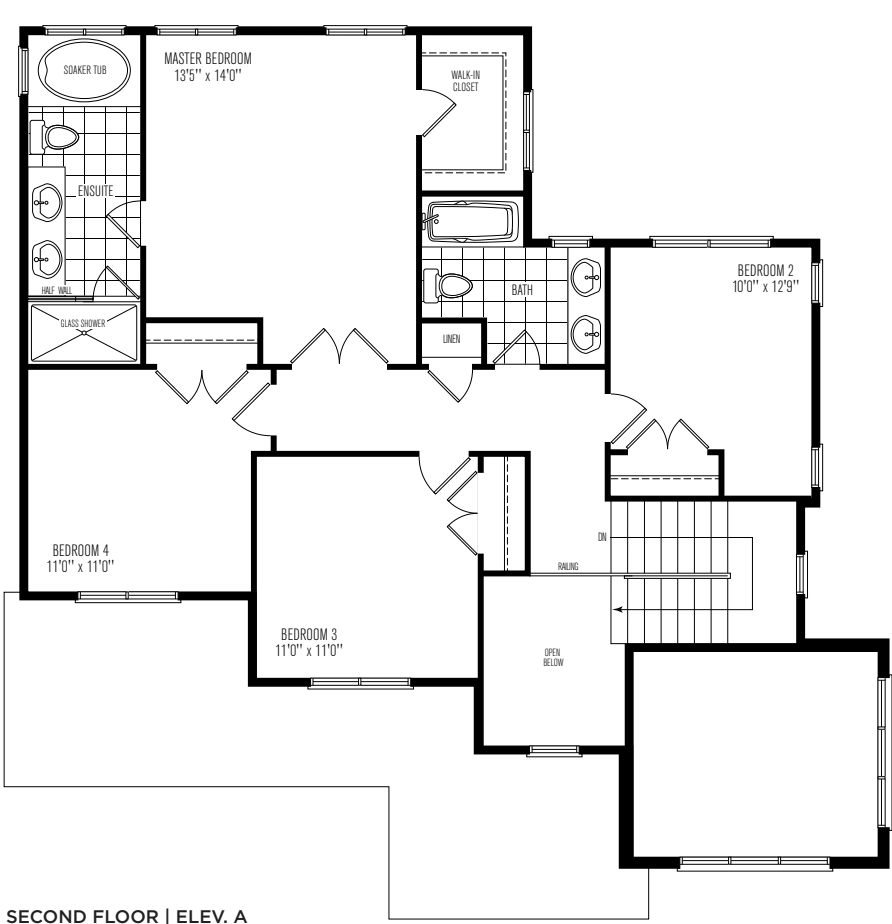
SECOND FLOOR | ELEV. A